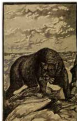
The four beasts of Daniel 7.